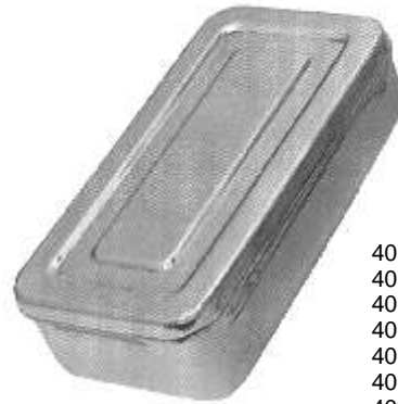
Instruments Box with Hooks