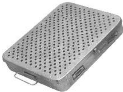
Instruments Box Perforated