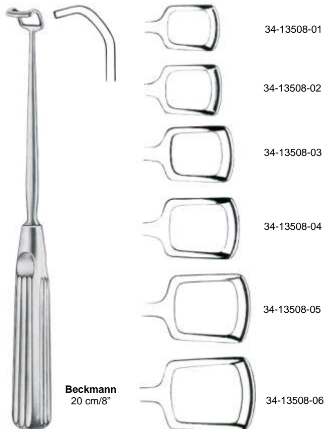
Beckmann 20 cm/8"