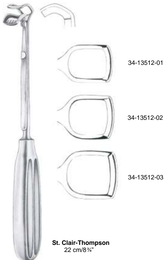
St. Clair-Thompson 22 cm/8¾"