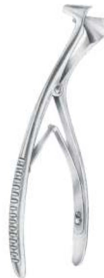
Beckmann 15 cm/6"