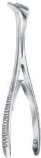
Tieck 13.5 cm/5 1/4"