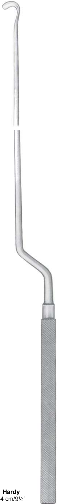
Hardy 24 cm/9½"