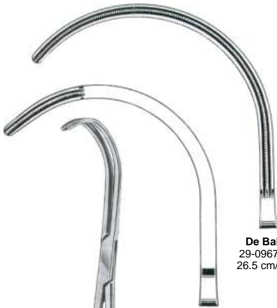
De Bakey 29-09677-26 26.5 cm/10½"