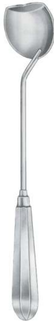
Moore 26-08506-28 28 cm/11"