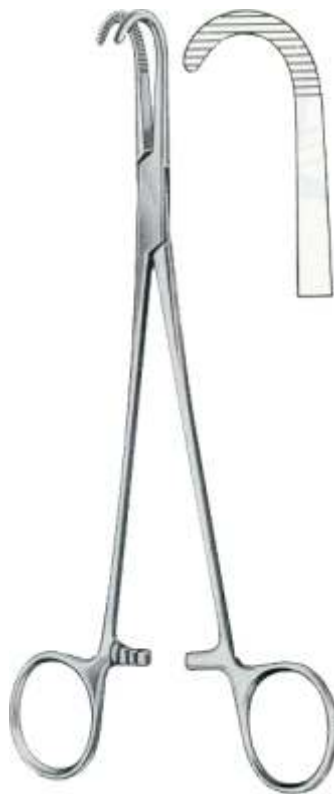
Desjardins 26-08458-21 21 cm/8¼"