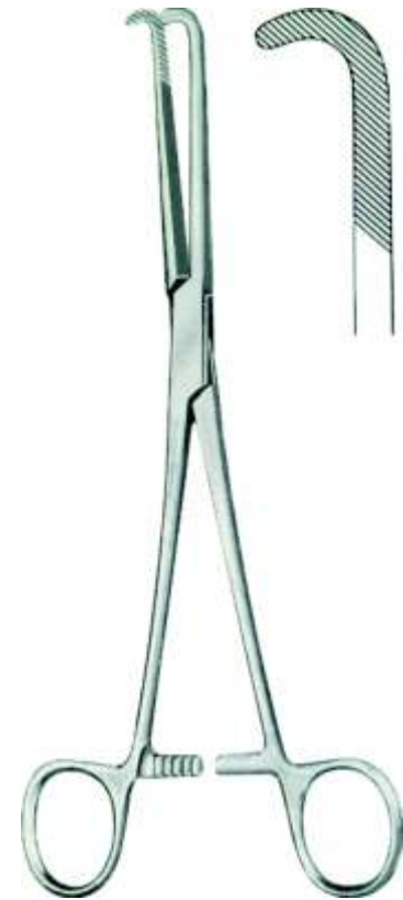
Nissen 26-08462-21 21.5 cm/8½"