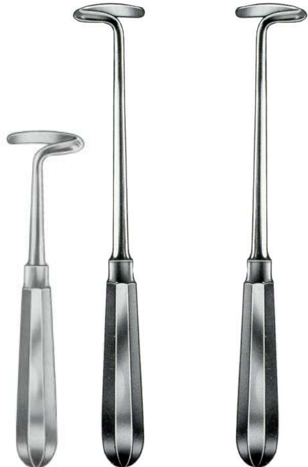
21-07190-01 Doyen 24 cm/9½" 21-07190-02