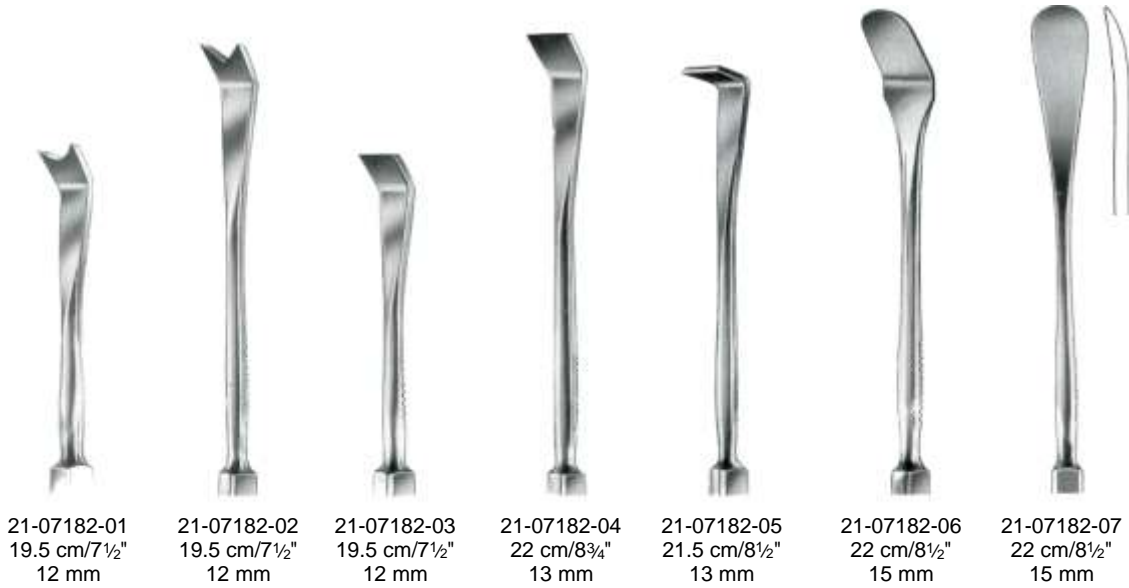
21-07182-01 19.5 cm/7½" 12 mm