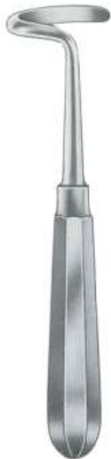
Doyen 17 cm/6¾"