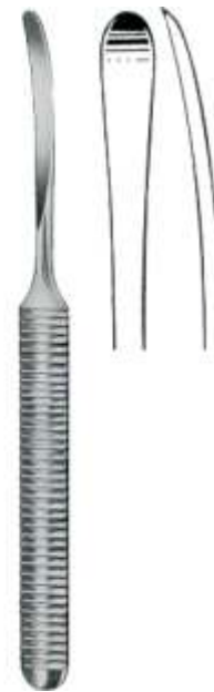
Williger 21-07154-16 16 cm/6¼"