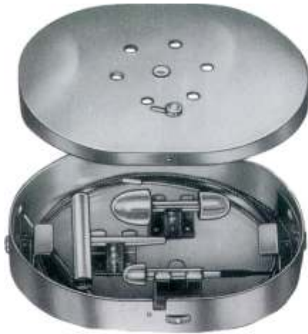
Nabatoff 18-06112-00 135x100x25 mm