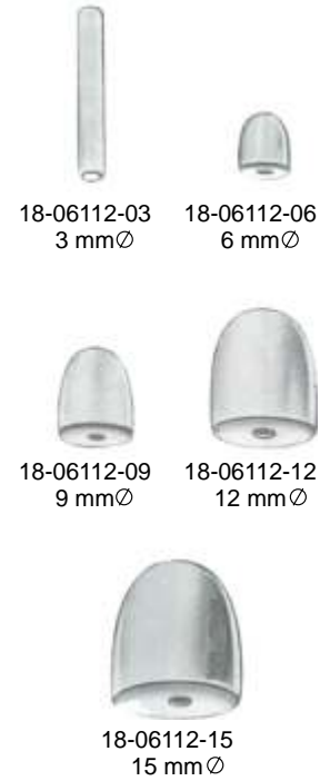
18-06112-03 3 mm Ø