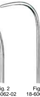
Fig. 3 18-6062-03