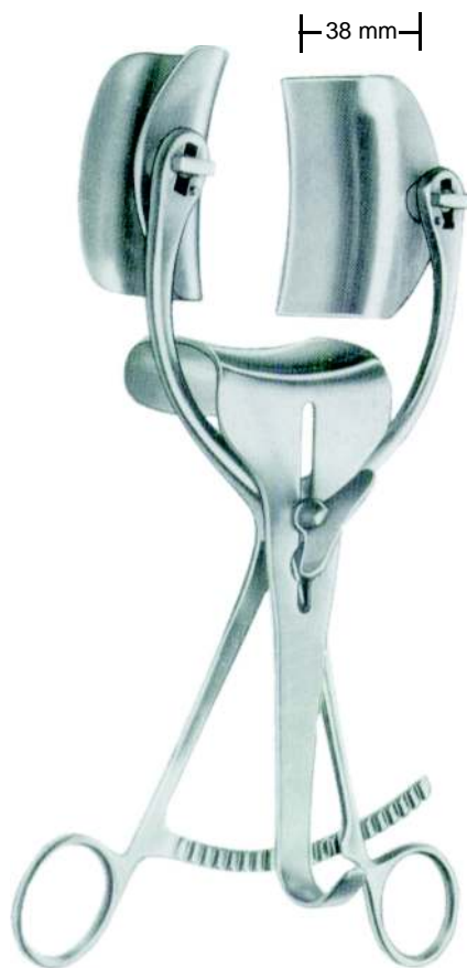
Collin 20 cm/8"