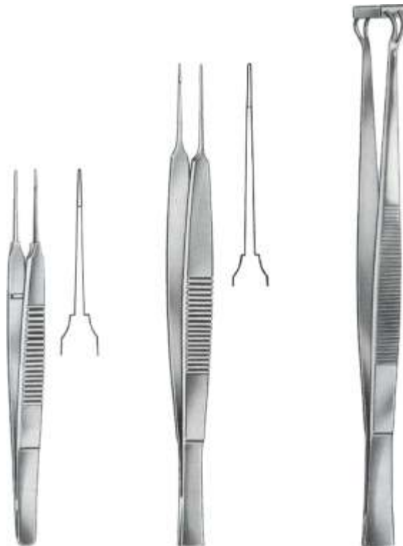
Austin 15-02906-14 14cm/5½"