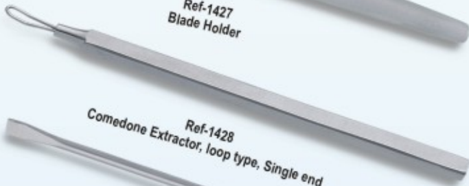
Ref-1428 Comedone Extractor, loop type, Single end