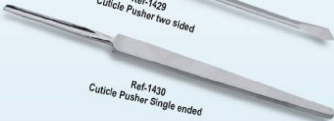
Ref-1430 Cuticle Pusher Single ended