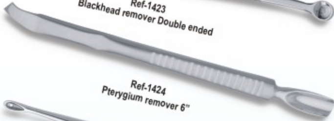
Ref-1424 Pterygium remover 6"