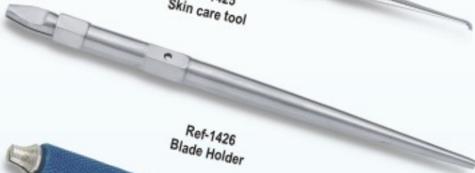
Ref-1426 Blade Holder