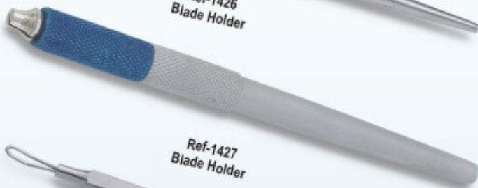
Ref-1427 Blade Holder