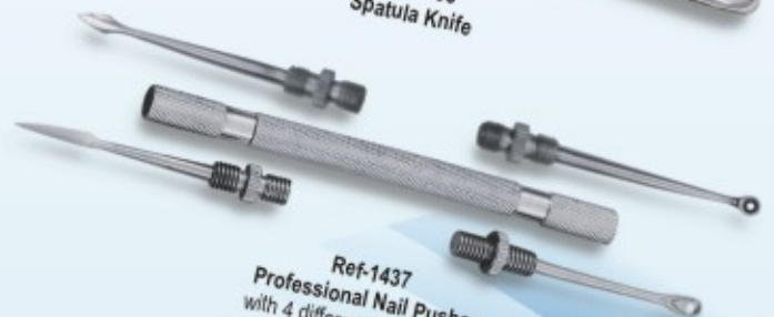
Ref-1437 Professional Nail Pusher with 4 different attachments