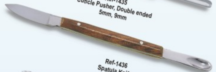
Ref-1436 Spatula Knife