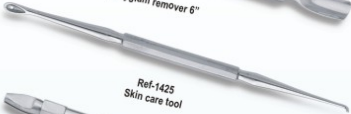
Ref-1425 Skin care tool