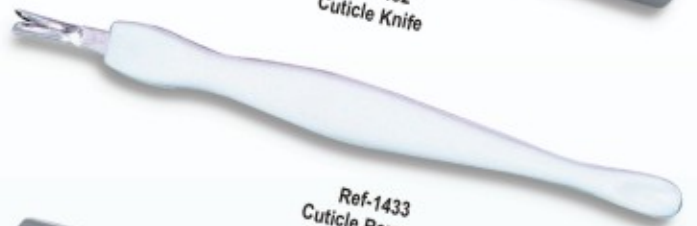
Ref-1433 Cuticle Remover 11.5 cm