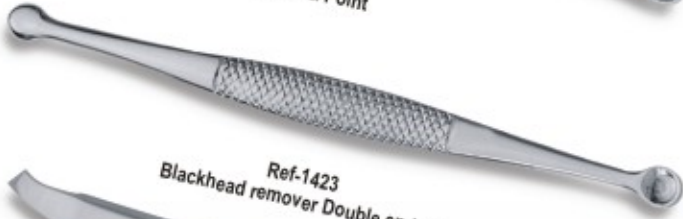
Ref-1423 Blackhead remover Double ended