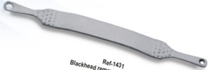
Ref-1431 Blackhead remover Double ended