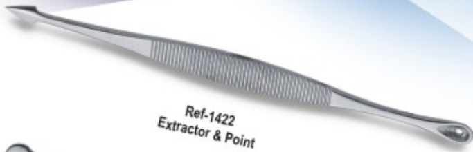
Ref-1422 Extractor & Point