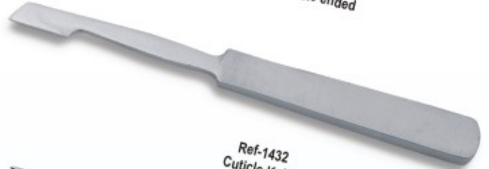
Ref-1432 Cuticle Knife