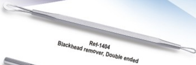
Ref-1404 Blackhead remover, Double ended