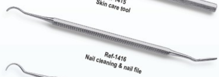
Ref-1416 Nail cleaning & nail file