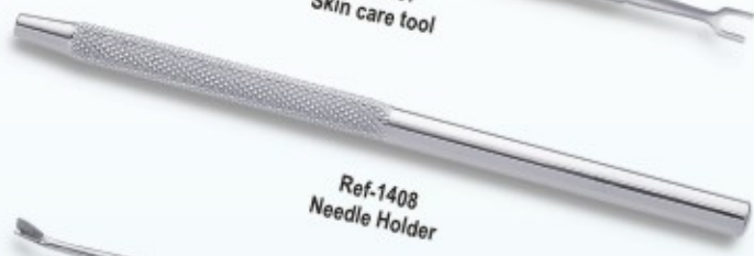
Ref-1408 Needle Holder