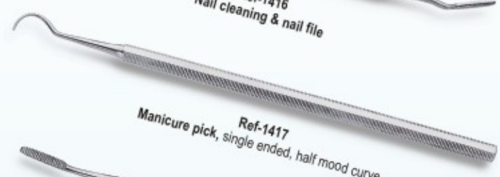
Ref-1417 Manicure pick, single ended, half mood curve