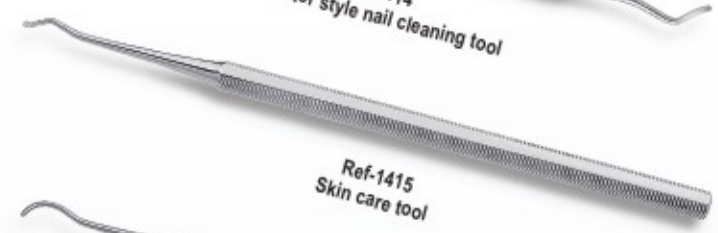
Ref-1415 Skin care tool