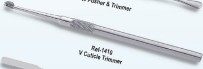
Ref-1410 V Cuticle Trimmer