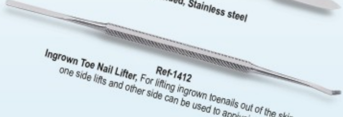
Ref-1412 Ingrown Toe Nail Lifter, For lifting ingrown toenails out of the skin, one side lifts and other side can be used to apply ointment