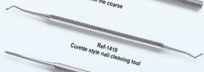
Ref-1419 Curette style nail cleaning tool