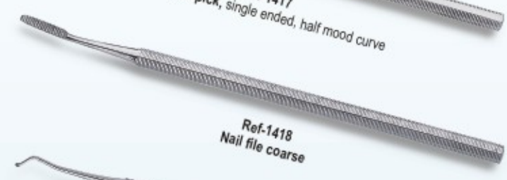
Ref-1418 Nail file coarse