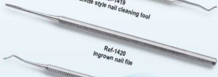
Ref-1420 Ingrown nail file