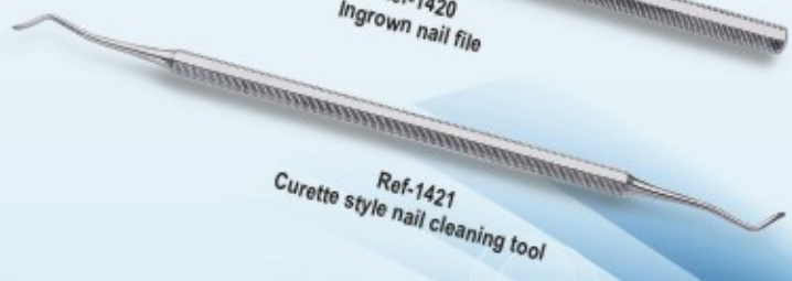
Ref-1421 Curette style nail cleaning tool