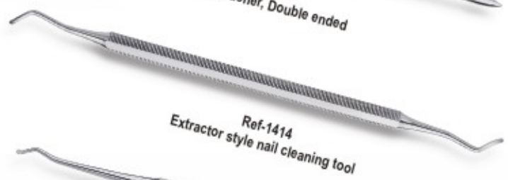
Ref-1414 Extractor style nail cleaning tool