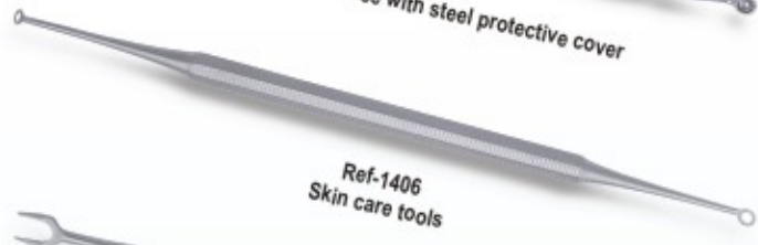
Ref-1406 Skin care tools