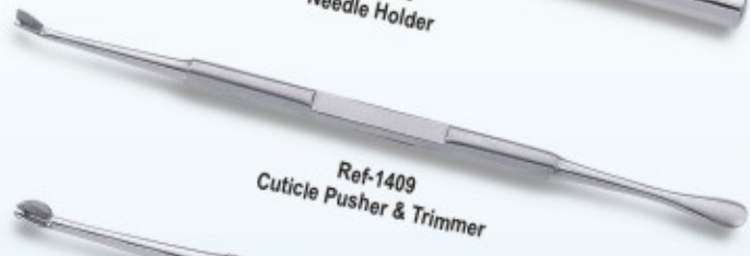
Ref-1409 Cuticle Pusher & Trimmer