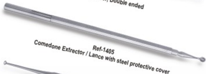
Ref-1405 Comedone Extractor / Lance with steel protective cover