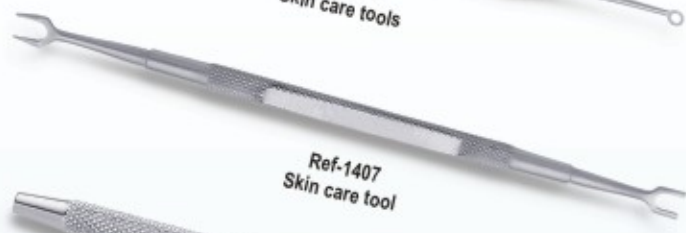
Ref-1407 Skin care tool